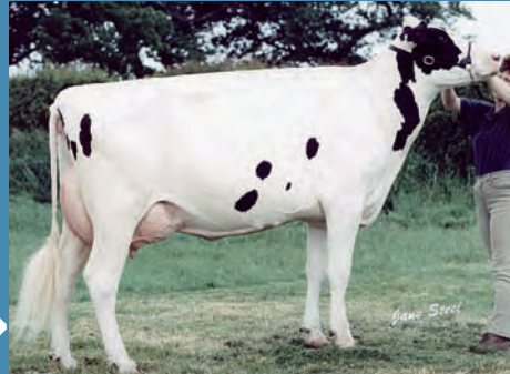
Witbourne Counselor Ghost EX-92