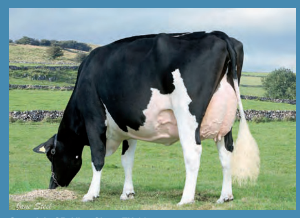
Sterndale CB Allen Ghost EX-92