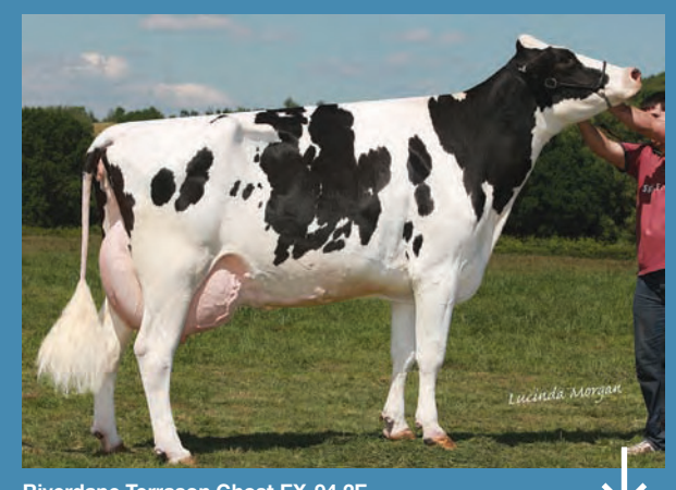
Riverdane Terrason Ghost EX-94 2E Sold for 27,000gns (EUR 34,000) as a bred heifer